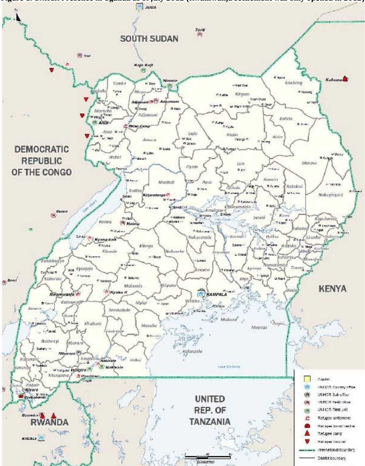
Figure 1: UNHCR Presence in Uganda as of July 2012 (Rwamwanja settlement was only opened in 2012)

refugee schools as well. On a similar note, Kaiser (2000) describes that in Uganda's Kibanda district, an estimated 40 per cent of the assistance provided by UNHCR was directed to the area surrounding the refugee settlement at Kiryandongo, in order to mitigate possible resentment by the local population. The Ugandan government as well as the UNHCR and its implementing partners stress the necessity of including the national population into the budgeting and planning of service provision in order to avoid conflicts. Notably, contradicting perceptions exist between the local